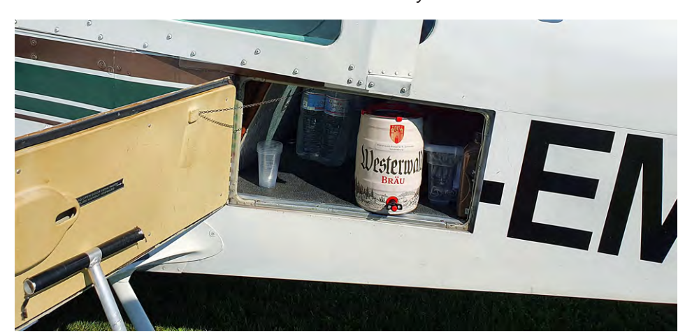
It is important to stay hydrated in the hot weather.

A young winner in front of the generous prizes.